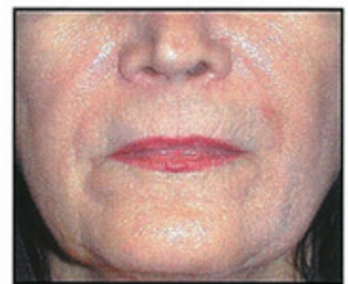
Above pictures, soft tissue fillers like Radiance and Restylane improve folds and lines around the mouth.